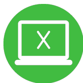
Pornography & Adult