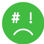
Suicide & Self-harm