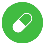
Drugs & Criminal Skills