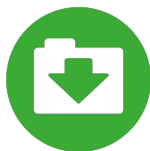
File Sharing & Hacking