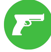
Weapons & Violence, Gore & Hate